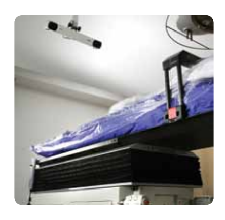
Fast and flexible cost saving tool

HexaPOD evo RT System comprises the HexaPOD™ evo RT couch top, equipped with the new generation homogenous carbon fibre couch top — based on the iBEAM® evo couch top and iGUIDE® system — including the camera tracking system and control consoles, both inside and outside the treatment room.