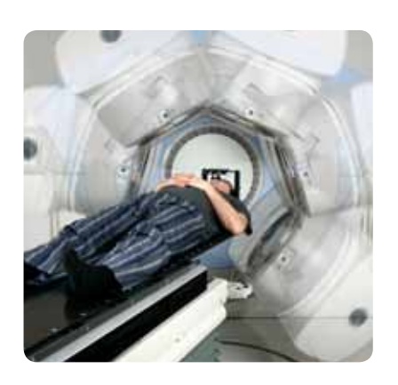
Designed with IGRT in mind

Both the Elekta range of head frames and Elekta HeadFIX® non-invasive immobilization devices can be attached to this couch top. These devices provide repeatable positioning accuracy ideal for volumetric intensity modulated arc therapy (VMAT), intensity modulated radiation therapy (IMRT), IGRT and stereotactic applications. Voluntary and involuntary patient movement can be minimized by using BodyFIX®, a non-invasive dual vacuum activated immobilization and positioning system. This system is ideal for VMAT, IMRT, IGRT and stereotactic applications.