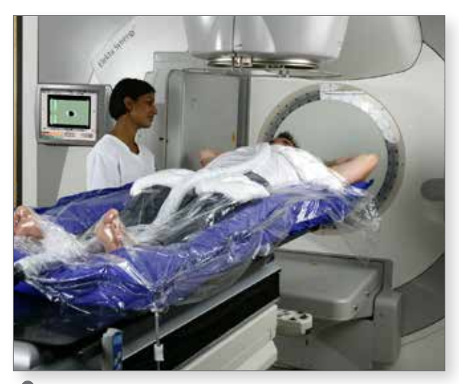
Immobilization with the BodyFIX system

Respiration-induced motion of tumors is still a clinical challenge in modern radiotherapy. Larger margins are often required to account for respiratory motion and consequently a larger volume of healthy tissue is irradiated. To increase the accuracy and efficiency for these kinds of treatments, the BodyFIX system offers diaphragm control to specifically minimize diaphragmatic movements. By applying pressure on the abdomen below the ribs, the diaphragm motion can be reduced and the motion of the target can be minimized.